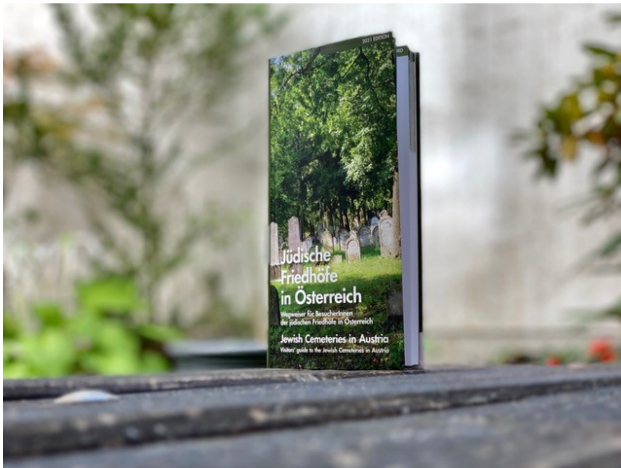
Visitor's Guide to the Jewish Cemeteries in Austria.

In September 2021, the National Fund published a "Visitors' Guide to the Jewish Cemeteries in Austria". The bilingual publication in German and English was produced together with the Jewish Communities and grassroots initiatives and for the first time includes all known Jewish cemeteries as well as Jewish sections of cemeteries in Austria.